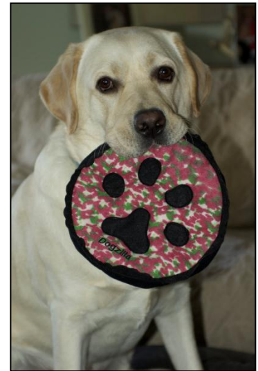
Our dog BLUE!